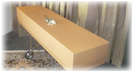
Left: eco-cardboard casket. Other traditional caskets are available at upgraded prices.